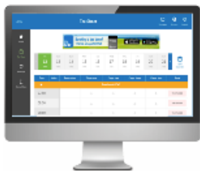
Members can book online